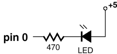
Figure 9.1: An implicit END instruction makes the LED blink.

After that, there are no more instructions for the Stamp to execute. With its work complete, the Stamp does the only sensible thing; it executes an END instruction and goes to sleep. During sleep, the LED stays on, but every 2.3 seconds it blinks off for a fraction of a second.